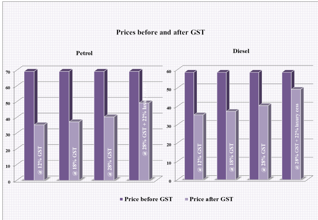
Figure 3: Price of petrol and diesel before and after GST